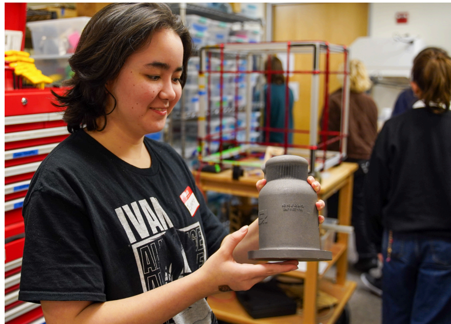
Days Off at Portland State University, grades 9-12