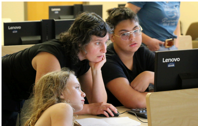
14 Summer Camp - Cartography Creators, grades 6-8