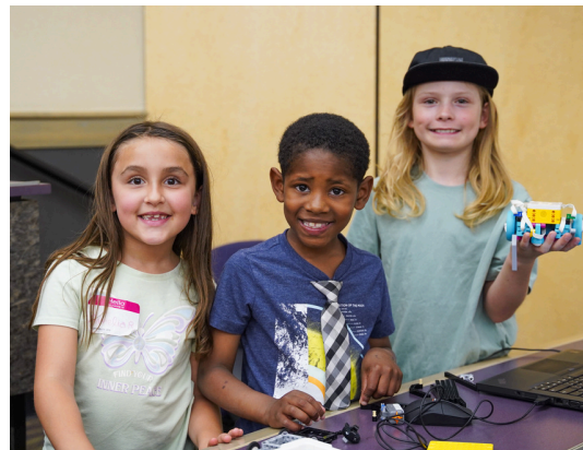
Summer Camp - LEGO Robotics, grades 3-5